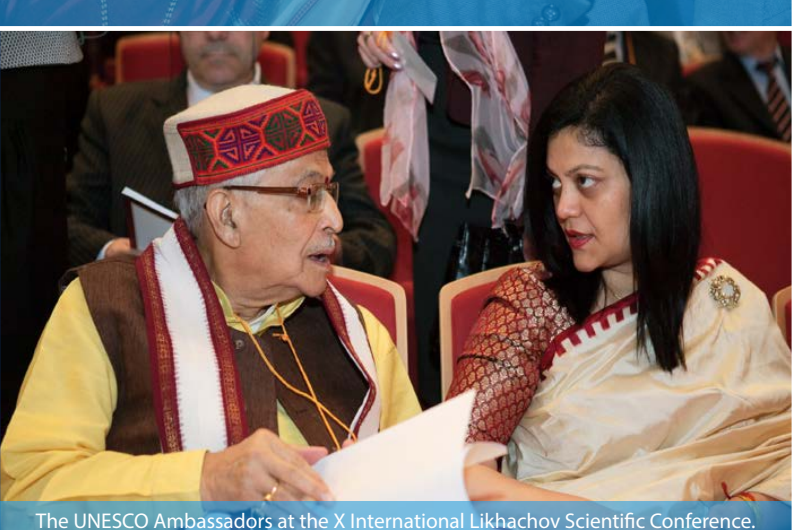
The UNESCO Ambassadors at the X International Likhachov Scientific Conference. 2010, SPbUHSS