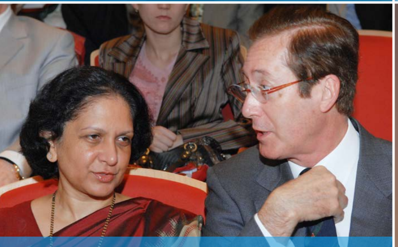
The UNESCO Ambassadors at the X International Likhachov Scientific Conference. 2010, SPbUHSS