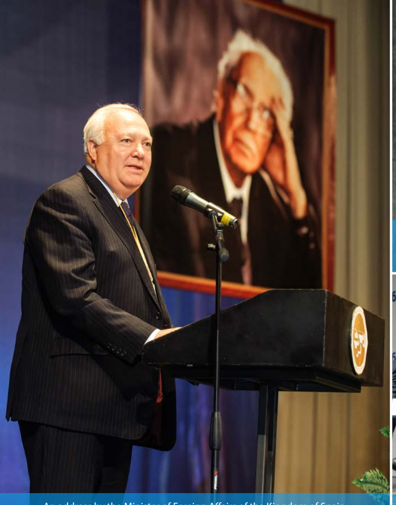
An address by the Minister of Foreign Affairs of the Kingdom of Spain (2004–2010), Doctor Honoris Causa of SPbUHSS Miguel Moratinos at the XIV International Likhachov Scientific Conference. 2014, SPbUHSS