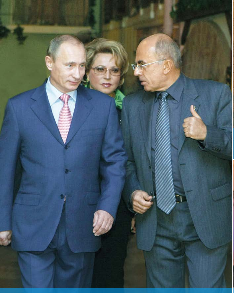
The visit of the Russian President Vladimir Putin in 2008 to SPbUHSS