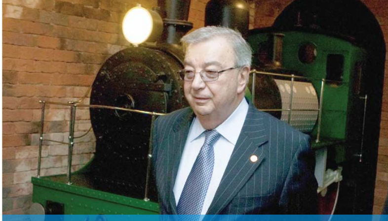
The visit of Minister of Foreign Affairs of the Russian Federation (1996–1989), Chairman of the Russian Government (1998–1999) Y. M. Primakov. 2009, SPbUHSS