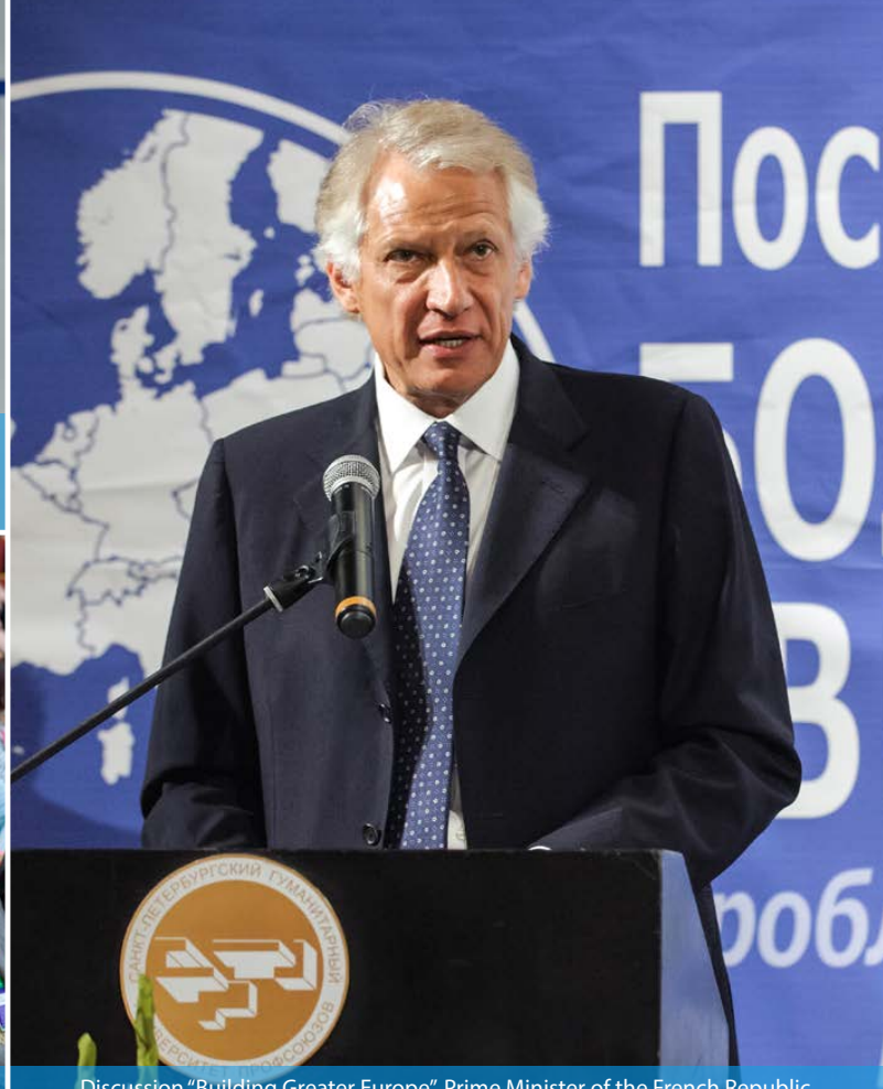
Discussion "Building Greater Europe". Prime Minister of the French Republic (2005–2007) Dominique de Villepin. 2014, SPbUHSS