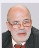
NAUMKIN V. V.

Ph. D. (Sociology). Minister of National Education of Poland (1996–1997), Deputy of the Sejm of the Republic of Poland (1991–1997, 2001), Professor