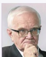
STYOPIN V. S.

Minister of Foreign Affairs of the Kingdom of Spain (2004–2010), Doctor Honoris Causa of SPbUHSS